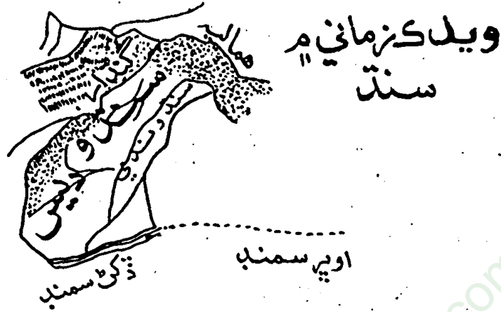
Map of Present Sindh